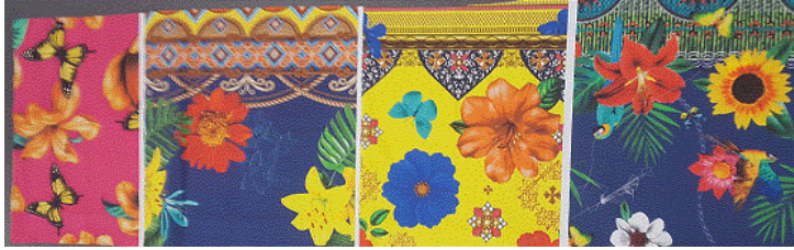
Request 14425_Sample 20879

Treatment with acetic acid: No Detergent used: ECE Multifibre type: DW