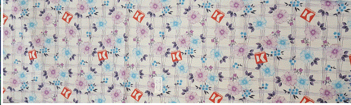
Request 14425_Sample 20881